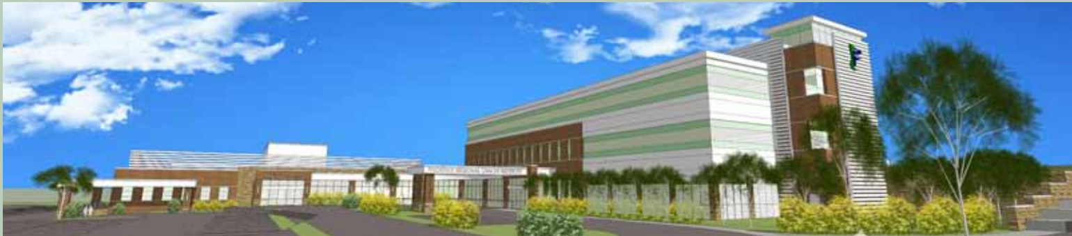
Artist's rendering of the new FMH Cancer Institute.

The FMH cancer care program is a highly-regarded center of excellence. Our physicians have a wealth of experience and expertise in medical, radiation and surgical oncology. Our oncology certified nurses, navigators, social workers, technicians, and other professionals provide compassionate care, emotional support, and complementary services. The care team works together with one goal: to assure that each patient has the benefit of an entire team of cancer experts, all focused on treating the body, mind, and spirit.