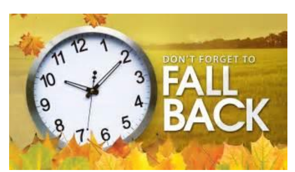
2 AM November 5th